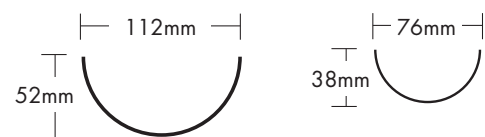
Half Round & "CAST IRON" HALF ROUND