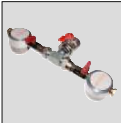
Straight Tee AC.TFK.ST