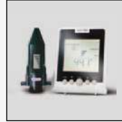
Sonic Smart GA.AP.SM