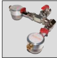
90° Tee AC.TFK.90T