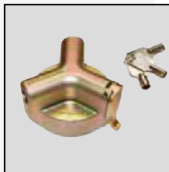
Spin Secure Tank Lock TL.020