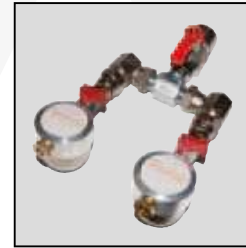
Parallel Tee AC.TFK.PT