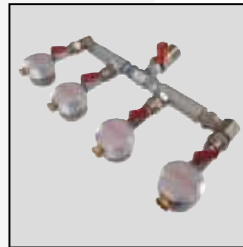
Parallel Tee 4 Gang AC.TFK.PT.4