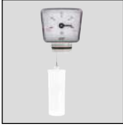
Clock Face GA.CG.4