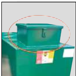
Locking Lid EXT.LID