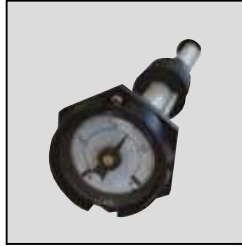
Spiral Float* GA.F2.4